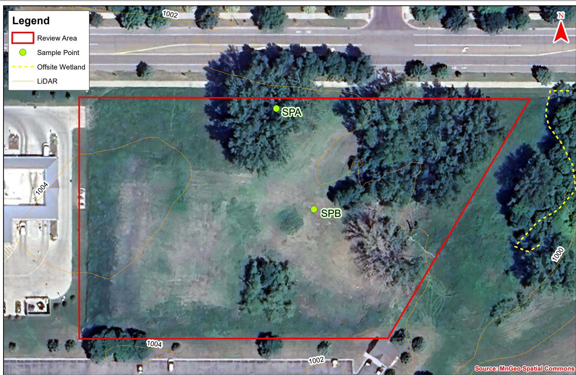
Figure 2 - Existing Conditions (2023, Google Earth)

Stadium Road McDonalds (KES 2025-091) Mankato, Minnesota